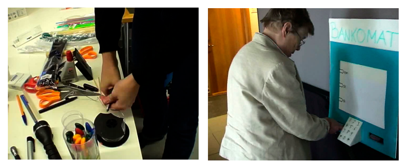
Figure 2 (left). Simple prototypes are made to help illustrate how the design scenarios that are constructed and recorded on video should be experienced.

Finally all participants look at all the video-prototypes that have been made during the workshop. Now everybody has the possibility to discuss and criticise them. In this phase participants reflect on and discuss how the described situations and corresponding ideas for improvement might be